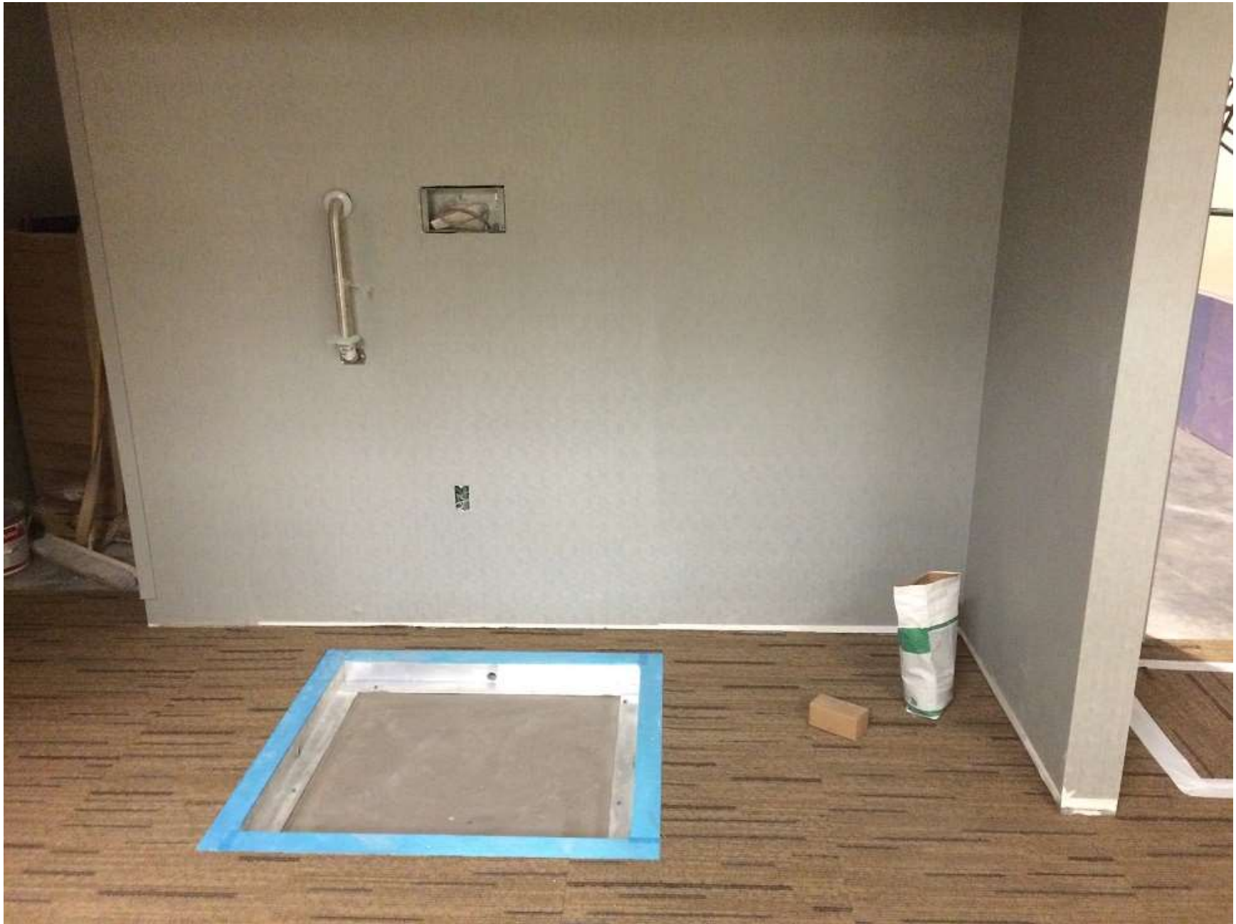
In Floor Scale Installed with flooring.