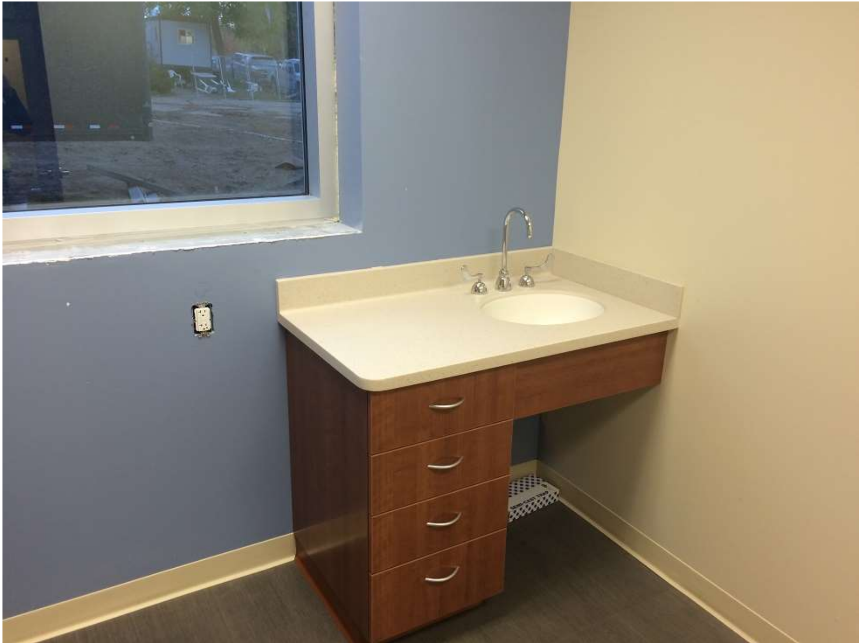
Electrical Devices and Plumbing Devices being installed.