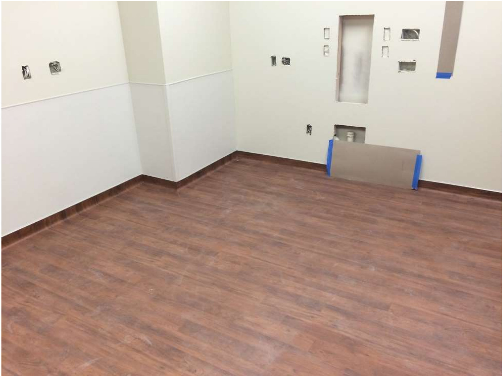
Room Finishes on Second Floor Surgical Area.