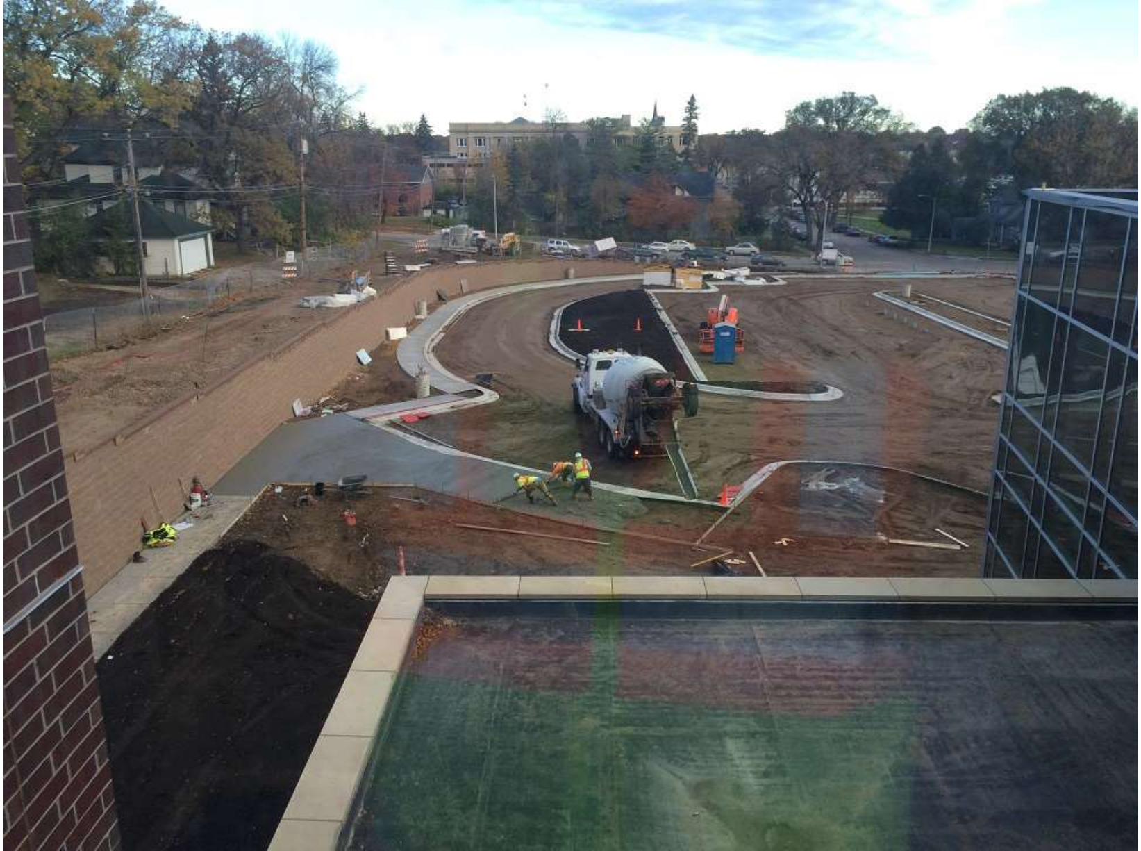
Sidewalks and Curb in North Parking lot.