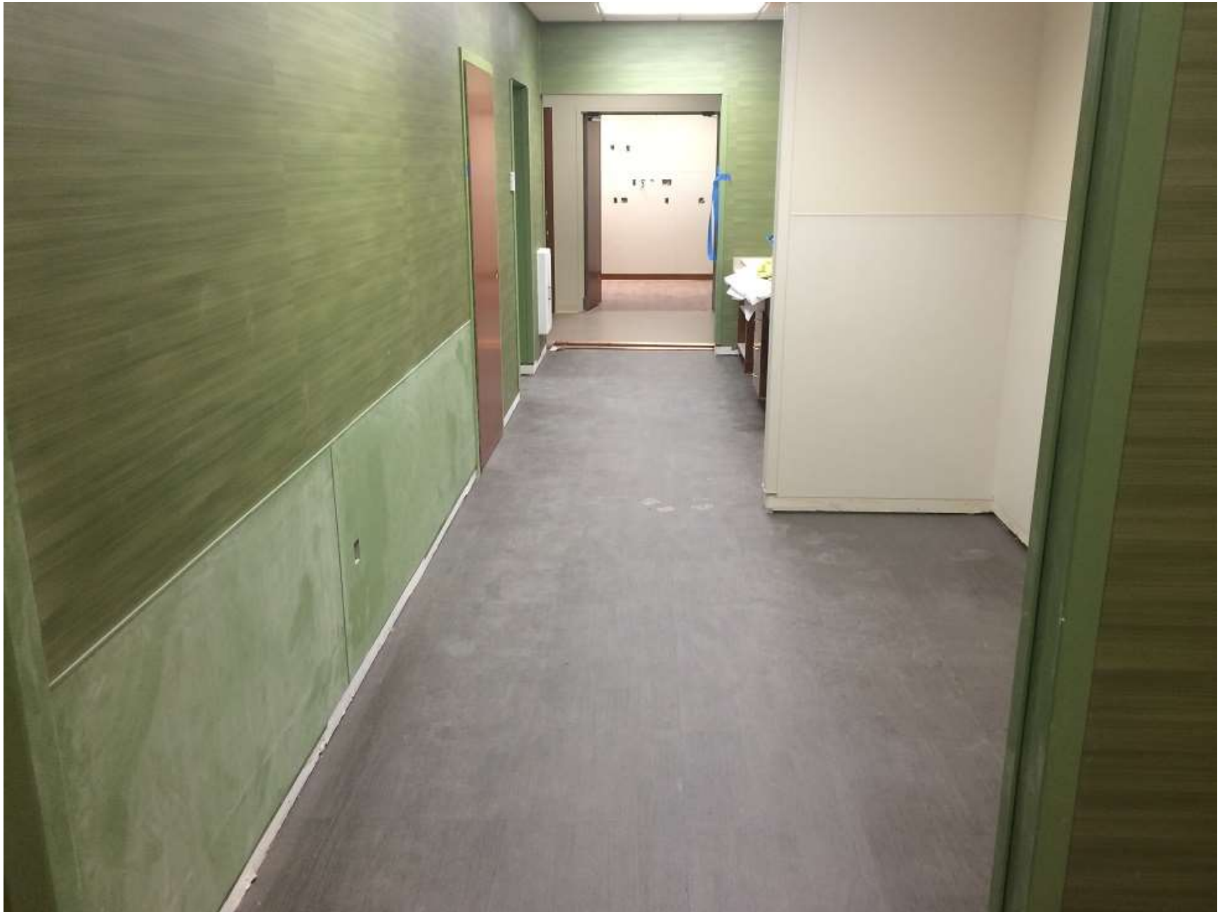
Corridor Finishes on second floor.