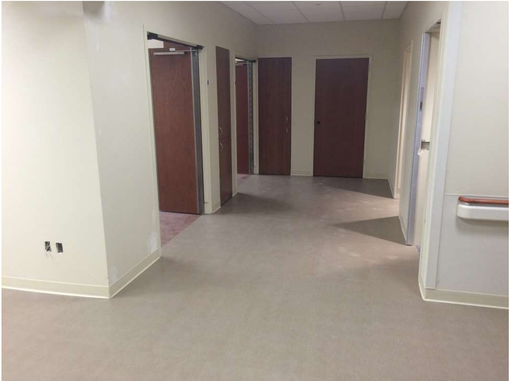
Corridor Finishes on Second level Surgical area.