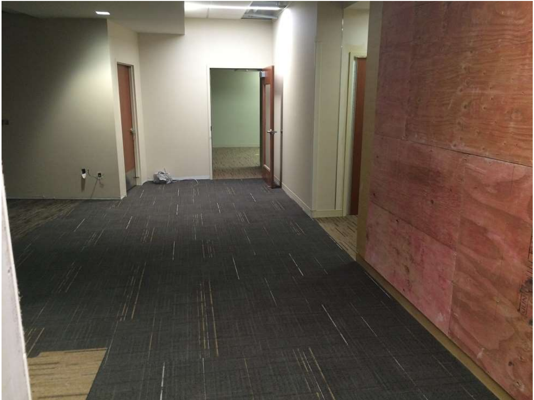
Corridor Finishes in place.